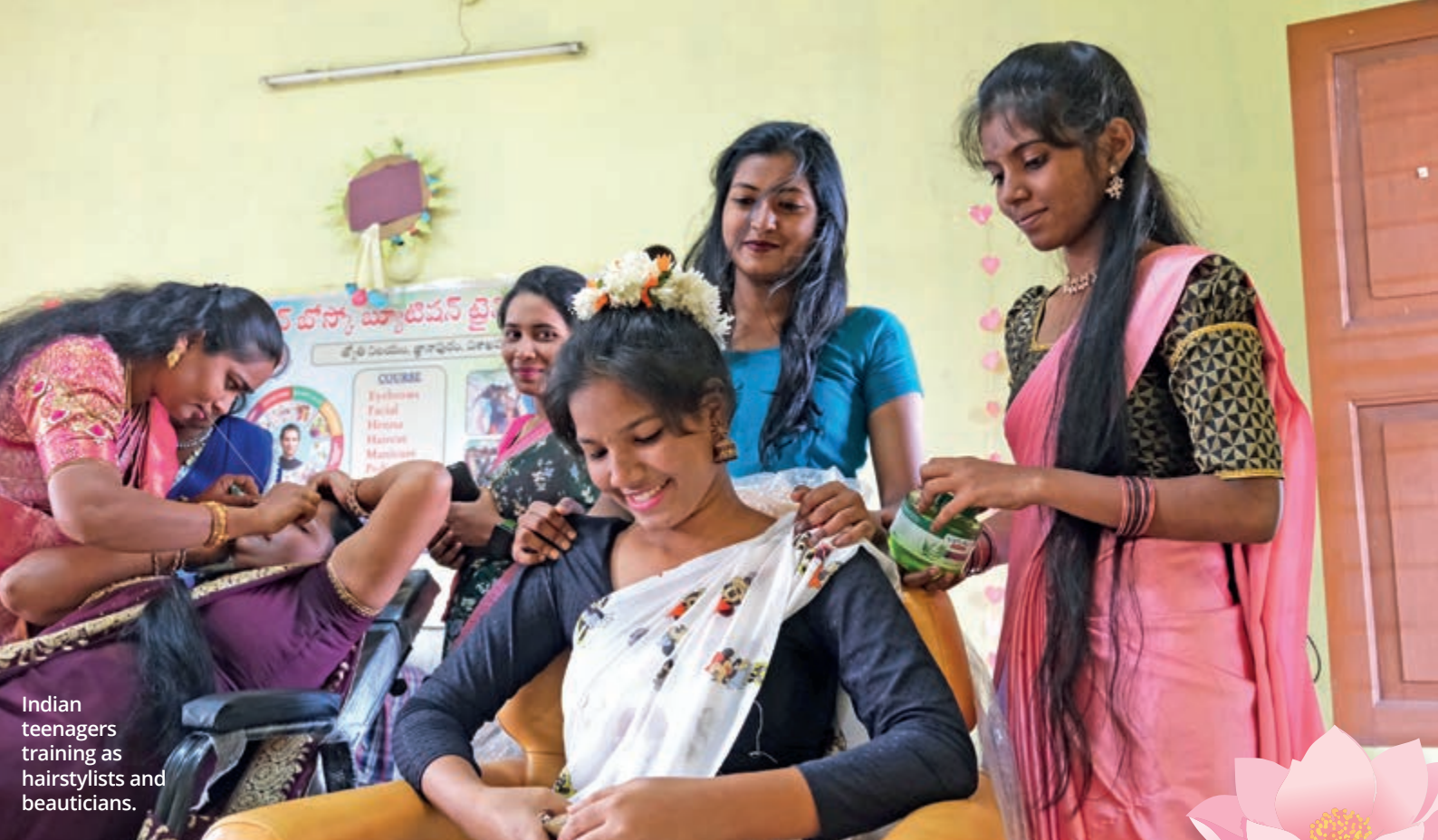
Indian teenagers training as hairstylists and beauticians.