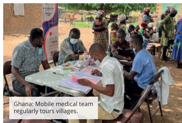
Ghana: Mobile medical team regularly tours villages.