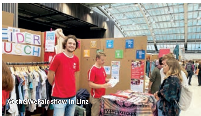
At the WeFair show in Linz

75 events dealing with education and voluntary work were held in the past year.