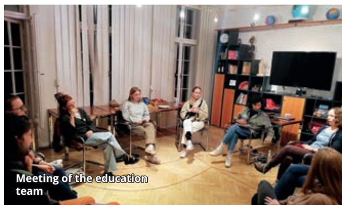
Meeting of the education team