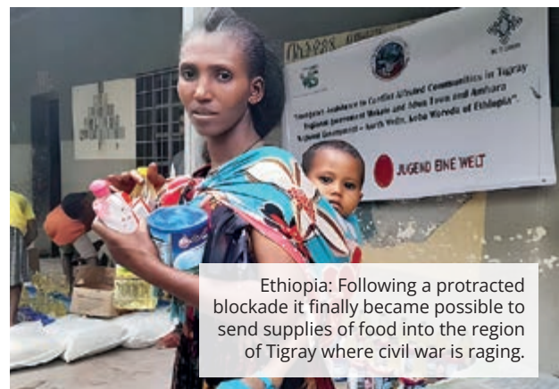
Ethiopia: Following a protracted blockade it finally became possible to send supplies of food into the region of Tigray where civil war is raging.