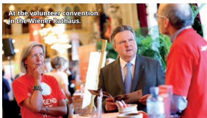
At the volunteer convention in the Wiener Rathaus.

52 voluntary staff members in Austria did unpaid work of various kinds for Jugend Eine Welt in 2022. This included working in one of the education teams, helping at events in which the organisation was involved or performing office duties.