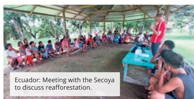
Ecuador: Meeting with the Secoya to discuss reafforestation.