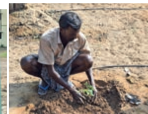
“Back To Nature” programme now extended to Nepal.