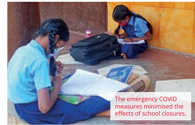
The emergency COVID measures minimised the effects of school closures.

The many volunteer helpers in our education teams in Austria filled in all the lockdowns with a series of online events and activities until real, face-to-face meetings, workshops and information campaigns were permitted at schools again, at least from time to time, in the second half the year. There were also several helping hands that supported the office work at the Jugend Eine Welt headquarters where all the employees smoothly switched between working from home and working at the office.