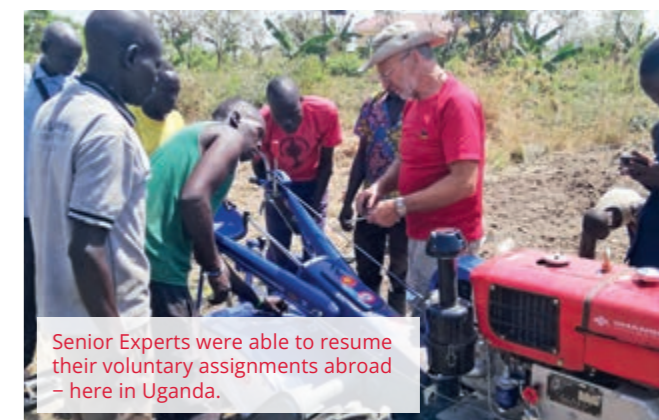
Senior Experts were able to resume their voluntary assignments abroad – here in Uganda.