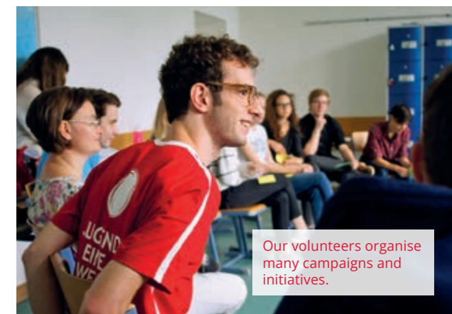
Our volunteers organise many campaigns and initiatives.