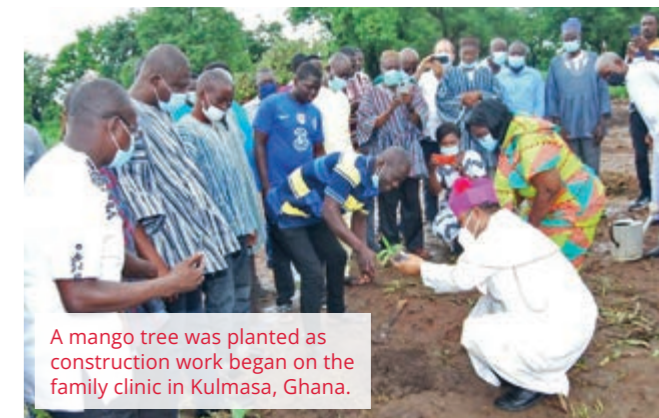
A mango tree was planted as construction work began on the family clinic in Kulmasa, Ghana.