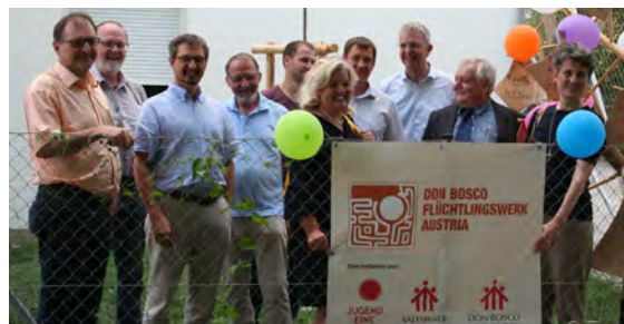
During the blessing of the new hostel.